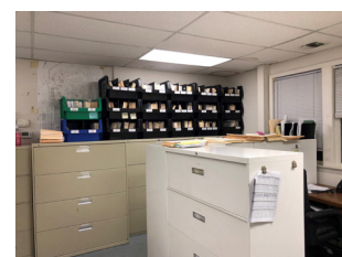
Building Department After