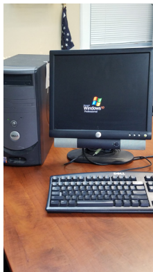
Existing Computers running outdated Microsoft XP