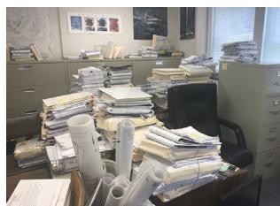
Building Department Before