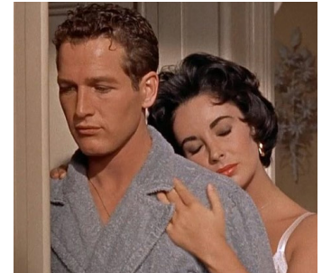
Image from the movie referenced in Question 4